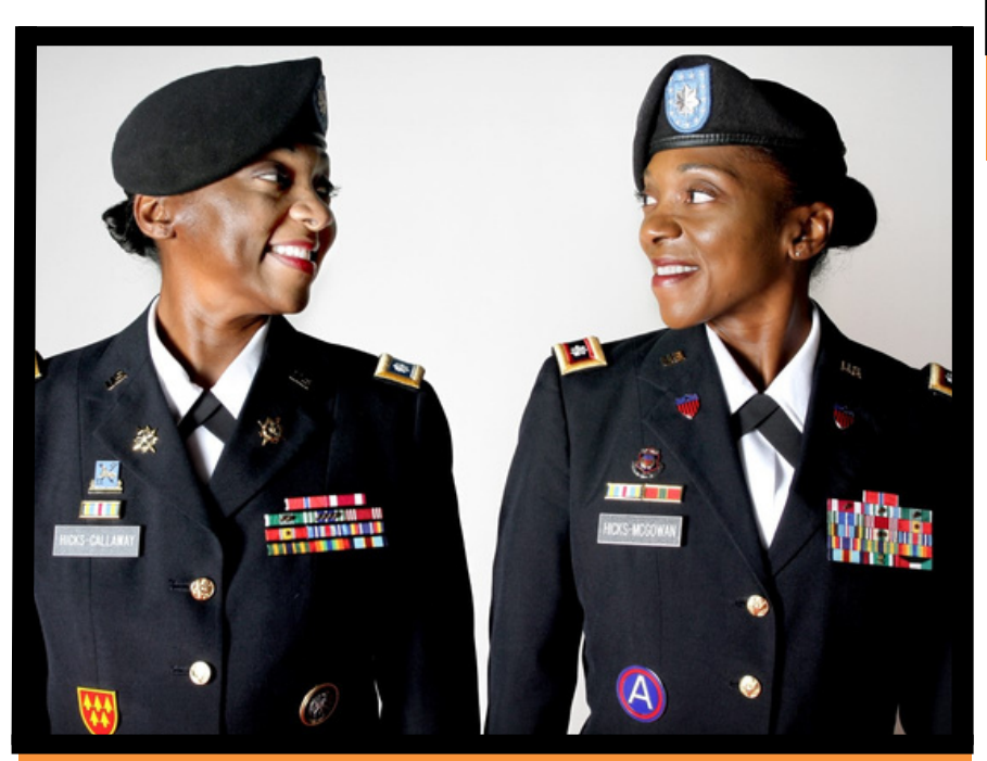
Hicks Twins after promoting to LTC (2011).