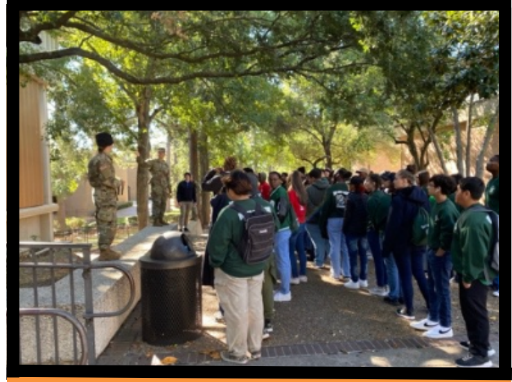
Cadets giving JROTC students a tour of the campus.