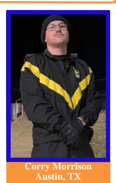
"I am a sophomore at SHSU and an MSII in the ROTC program. What I look forward too is going to New York with my Model United Nation team this semester! Not only that, but I will be studying for my LSAT, so I can hopefully secure a law school before graduation in 2025. Last but not least, I am very excited about the Multiprogram FTX; I look forward to all the knowledge